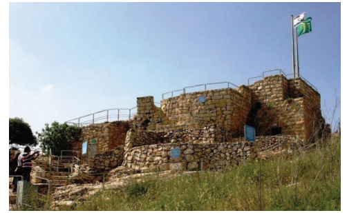
The Kastel Fortress